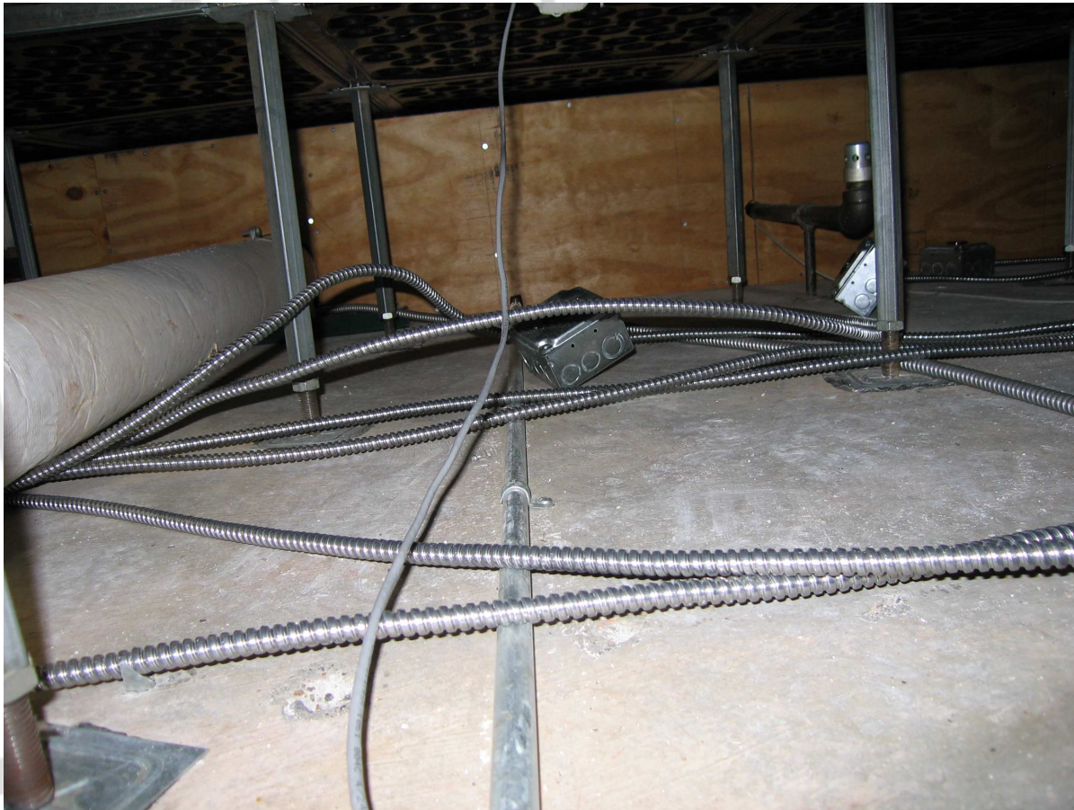
Authentic raised floor